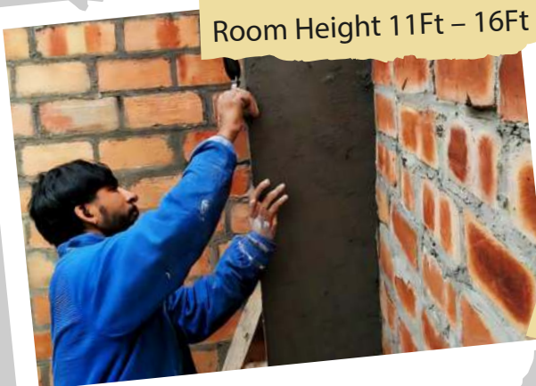
Room Height 11Ft – 16Ft