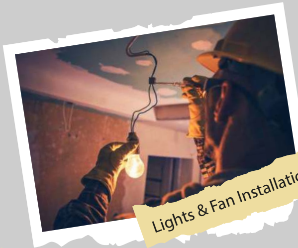
Lights & Fan Installation